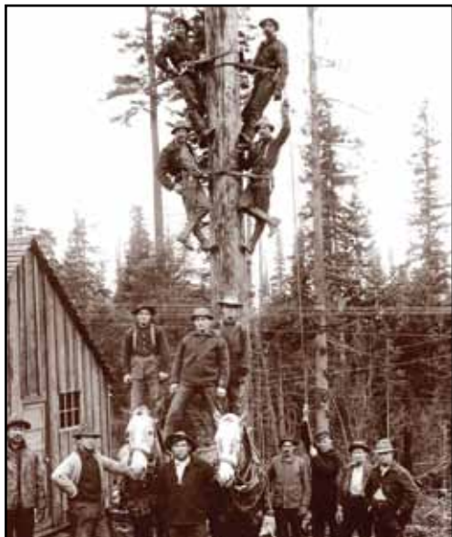
Olympic Power Line Crew circa 1914 Stringing 65 kV transmission line from the Elwha Dam towards Port Townsend.