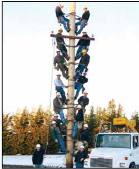
Clallam County PUD Line Crew, 2008 Continuing a long tradition of exceptional service and dedication rain, snow or shine.